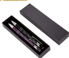
A Personalized Pen