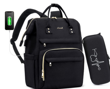
A Backpack with Charging Port