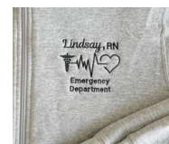
An Embroidered Medical Jacket