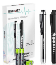
A Pen Light