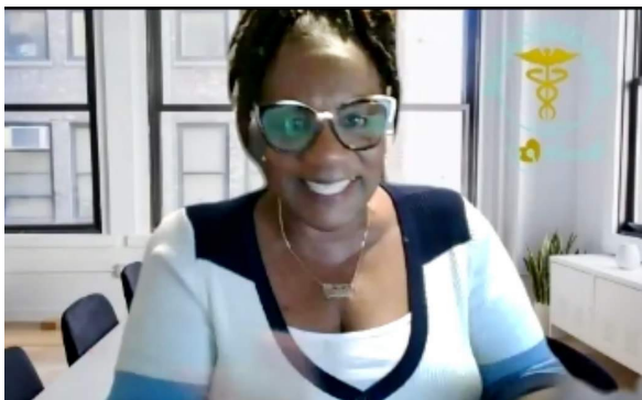
HON. DARREN SOTO MEMBER OF CONGRESS